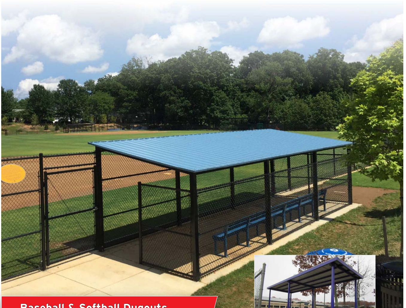
Baseball & Softball Dugouts