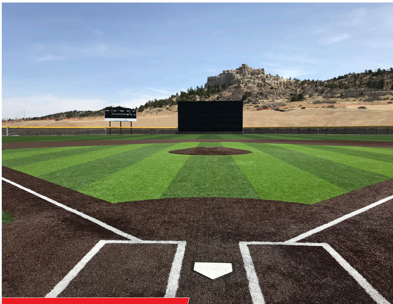
Outfield Batter's Eyes