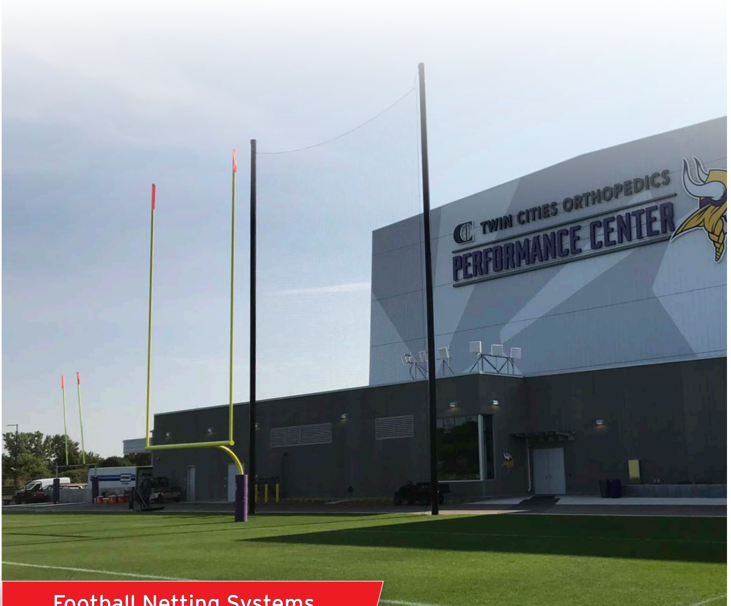
Football Netting Systems