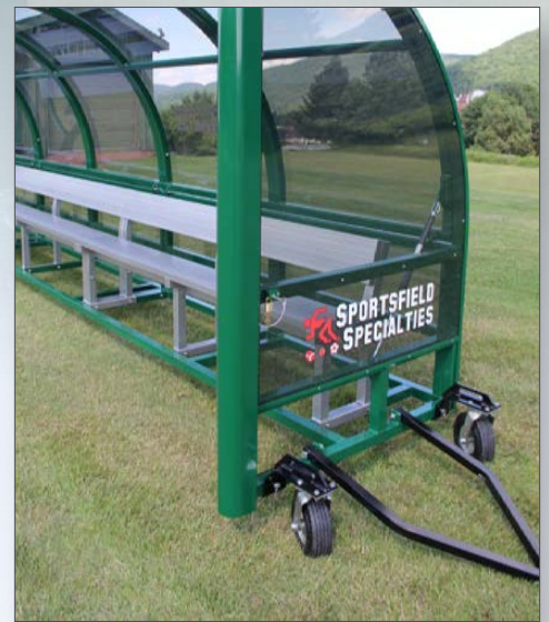
Optional mobility kit