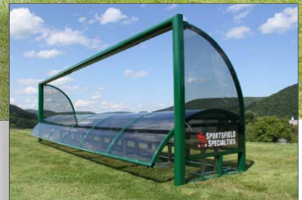
WeatherScape® Team Shelters