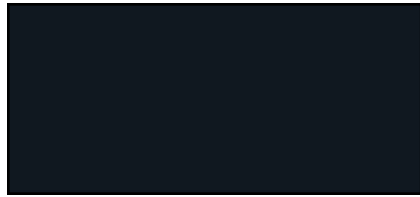
Black 6 C