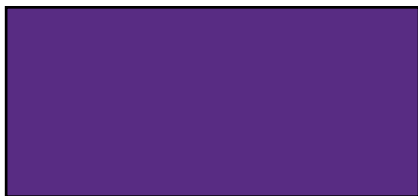
Purple 268 C