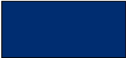
Blue 288 C