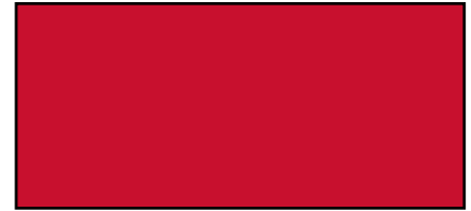
Red 186 C